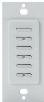
3 ZONE, 9-BUTTON WALL STATION