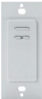
1 ZONE, 3-BUTTON WALL STATION